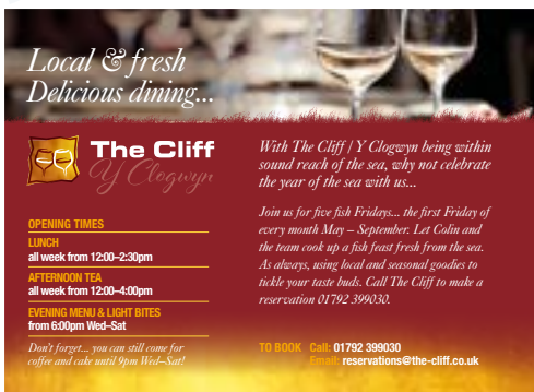
Example of advertisement in Beaches & Gower Coast Path Guides