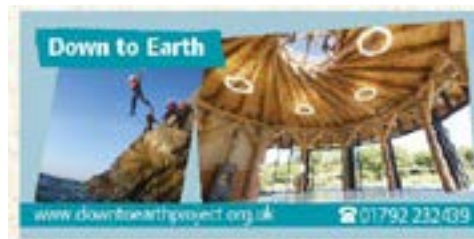
Standard layout example, quarter page