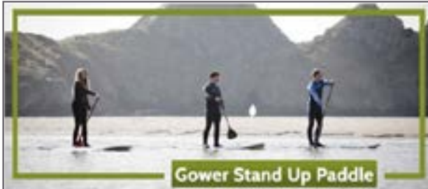
Gower Stand Up Paddle

Stand Up Paddle boarding is an easy, accessible and versatile water sport that offers a fantastic way to experience the water. It's one of our most popular watersport activities – so why not try it out with Bay. Close this Half Term before Winter strikes!