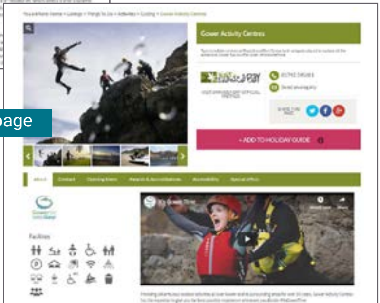
Premium Package webpage